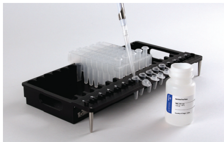
Figure 2. Setup and configuration of the deck tray(s). Elution Buffer is added to the elution tubes as shown. Plungers are in well #8 of the cartridge.