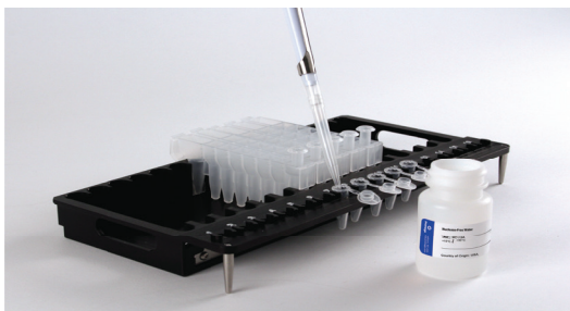
Figure 2. Setup and configuration of the deck trays. Nuclease-Free Water is added to the elution tubes as shown. Plungers are in well #8 of the cartridge.